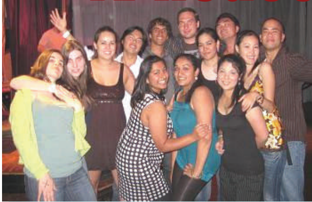
1st picture: House 1086 residents and other International Village residents out at "Tapas".