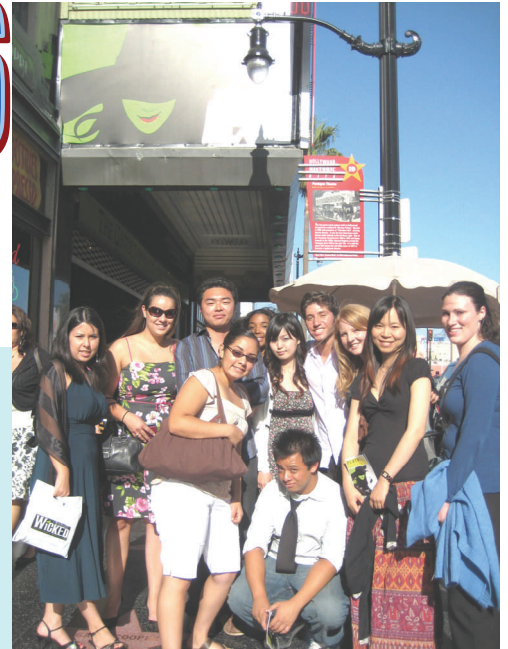
2nd picture: IV people in Hollywood to see Wicked the Musical